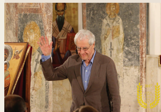
MR. CHARLES SIMIC Laureate of the "Golden Wreath" Award for 2017

JPCCommittee - News from the Assembly of the Republic of Macedonia, No. 54, July-August 2017